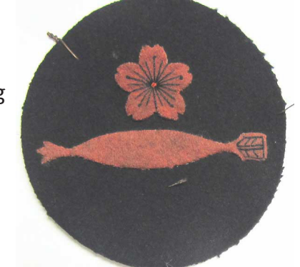
Badge with cherry blossom for a sailor

The mannequin on the right wears the uniform of a 1st sailor elite gunner ( UNYO HO ) with the Japanese imperial Navy. Note the characteristic leather apron, the bar for good conduct on the sleeve and the cherry blossom, the Japanese insignia rewarding exceptional conduct in a military function.